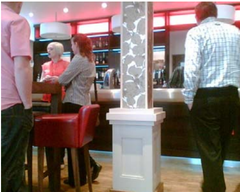
Vascos Bar & Restaurant