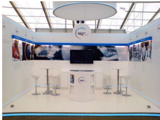
ARG Exhibition Stand