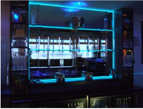
AMC Cinema Bar, Birmingham.