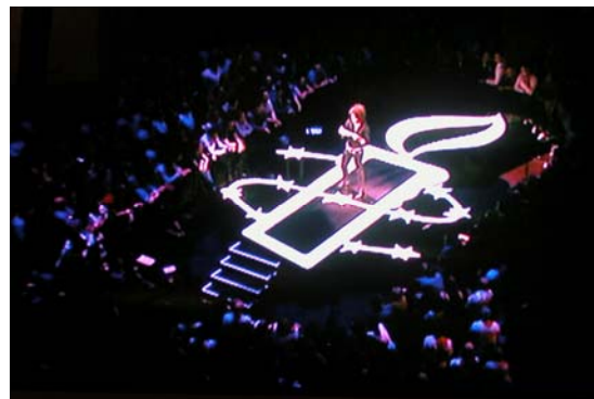
Large Light Tape Floor display Amnesty International's Secret Policeman's Ball London's Royal Albert Hall