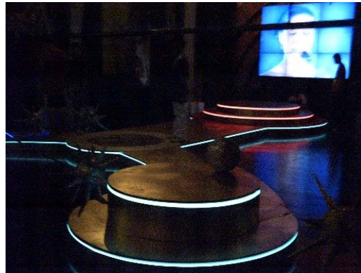
TV Studio Stage Steps