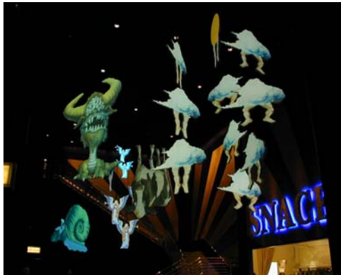
Spamalot Terry Gilliams characters in the Las Vegas production of Spamalot.