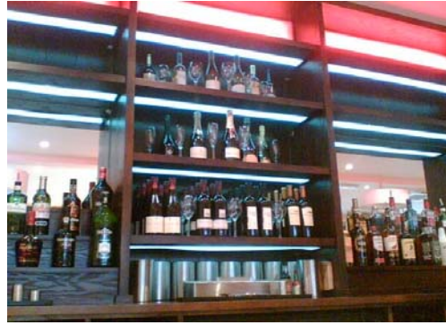
Vascos Bar & Restaurant